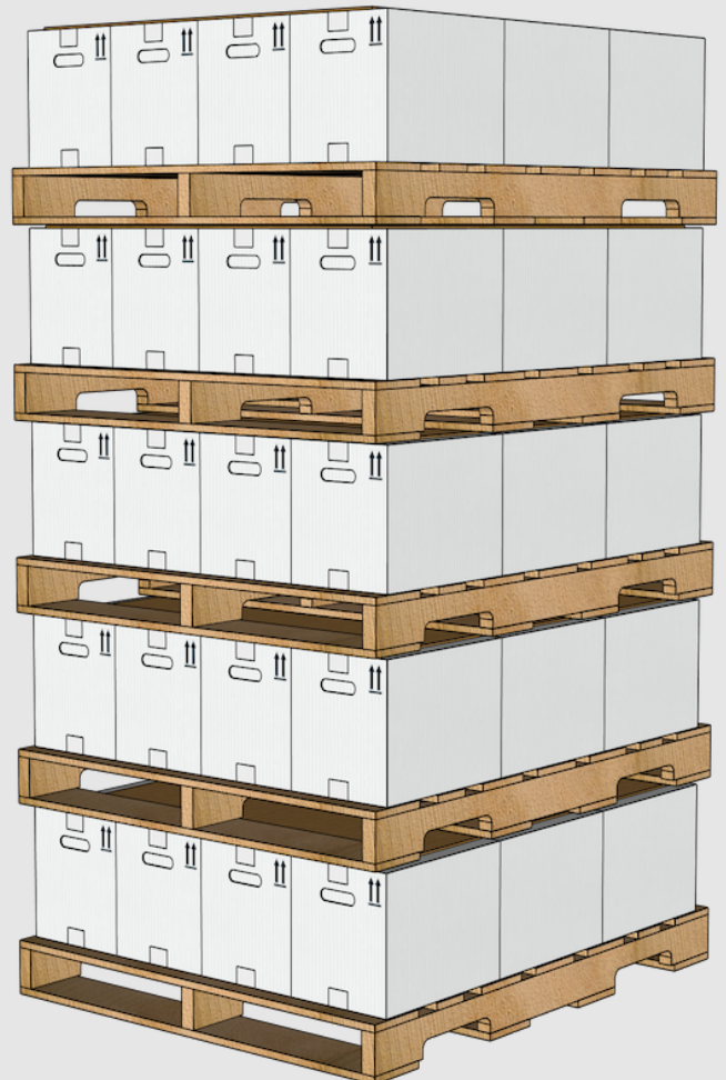
Required Warehouse Space - 48" x 40" x 100"